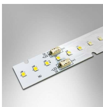
LED Strip Module