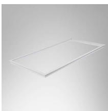
Concealed Ceiling Frame 600x1200mm.