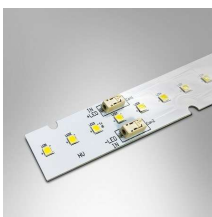
LED Strip Module