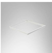
Concealed Ceiling Frame 600x600mm.